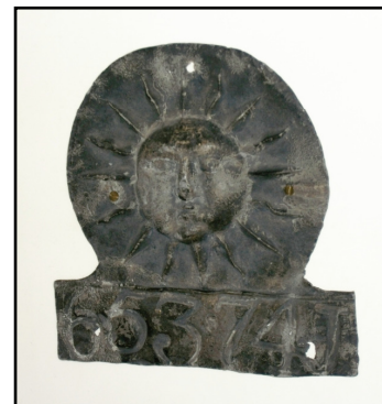
1796 fire mark of the Sun Fire Office

If you have visited our offices in West Bromwich you will not have failed to see our display of fire insurance marks in our reception area. Fire insurance marks were lead or copper plaques embossed with the sign of the insurance company, and placed on the front of the insured's building as a guide to the insurance company's fire brigade. They were used in the eighteenth and nineteenth century in the days before municipal fire services were formed. The first to use these marks was the Sun Fire Office before 1700. For most of the 18th century, each insurance company maintained its own fire brigade, which extinguished fires in those buildings insured by the company and, in return for a fee to be paid later, in buildings insured by other companies. Ault's reception area has a fine display of nearly seventy marks, some genuine and some replicas. A real bit of history !